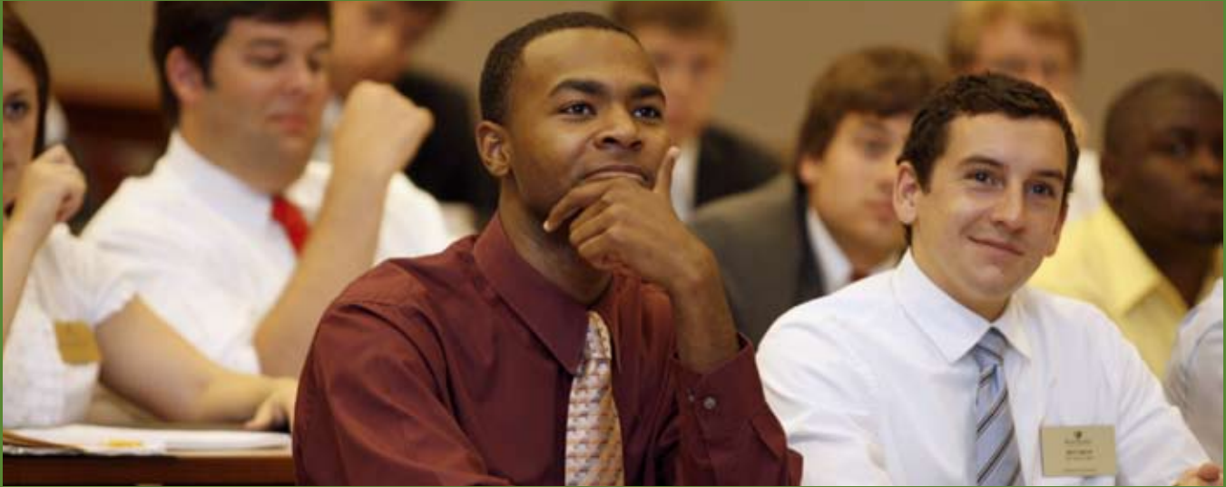
MA IN MANAGEMENT CLASS OF 2010